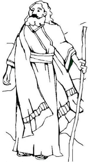
Clue: father of Faith (Genesis 15:1-6)