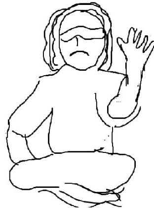
Clue: "Go; your faith has made you well" (Luke 10:46-52)

UNWRAP THE GIFT FROM GOD, THE TINY SEED OF FAITH, ALLOW LORD TO PLANT IT IN YOUR HEART LET IT GROW IN HOLY SPIRIT WITH WISDOM, LOVE ,HUMILITY AND OBEDIENCE CAN YOU DRAW YOUR PLANT OF FAITH???