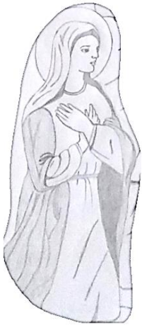
Clue: Luke 1:38