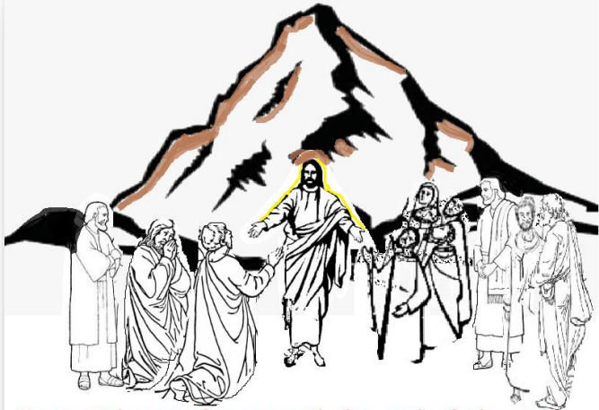
ASCENSION OF OUR LORD JESUS

I am with you always, until the end of the age. -Matthew 28:20