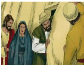
clue: John 11:39