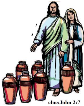
clue: John 2:7