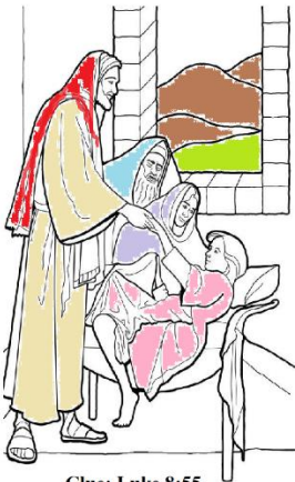
Clue: Luke 8:55