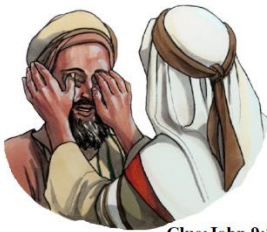
Clue: John 9:7